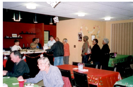
Spaghetti Dinner, Newman Center

The Civil Service Council Education Assistance Committee thanks all those who participated in the Committee's Fall 2012 fund raisers. Over $3500 was raised from the sale of tickets to the Spaghetti Dinner and Silent Auction held at the Newman Center on December 8, the Holiday Raffle held on December 5 and the Old Main Lunch Buffet held on October 17.