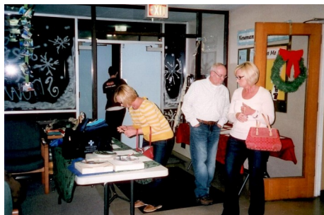
Bidders for Silent Auction

Funds raised went toward Spring 2013 scholarships for the following 24 dependents of SIU Carbondale Civil Service employees: