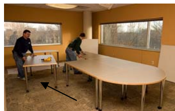
Furniture assembly; large table splits into smaller ones, as needed.

students can meet to study or to work on group projects and assignments. The renovation will provide for many different types of gathering-areas within the building. There will be a rotunda area on the ground floor for various Library social functions, community and campus meetings, and events. The rotunda area sits adjacent to a 500-seat auditorium.