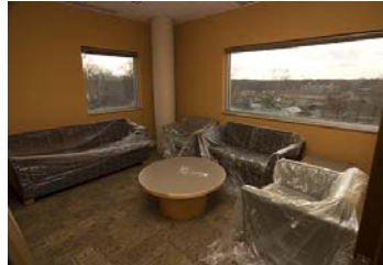
Furnished Study Room

changed. He stated further that the "New Morris" will differ from the Morris Library of previous generations by the addition of 30 group-study rooms in which