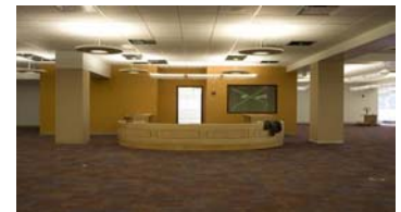
Third Floor Information Desk