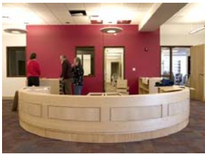
Fourth Floor Map Library Information Desk

The Library staff has now taken possession of floors 3, 4, and 5, and the fourth floor staff is busy moving books from